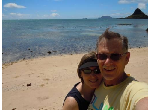
Relaxing on a beach in Hawaii !